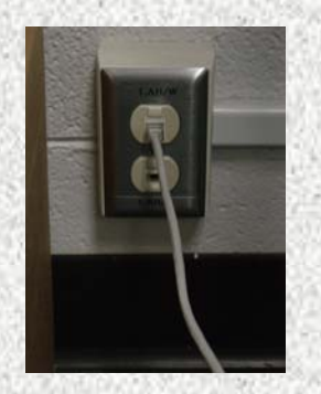
Plug the network cable into an outlet.

DO NOT plug the cords into a surge protector.